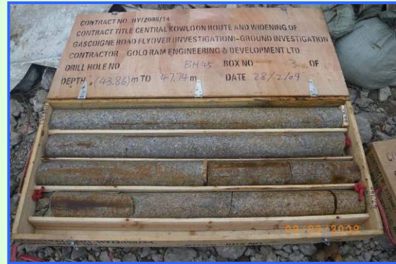
岩石樣本 Rock Sample

When ground investigation is carried out, the engineering staff takes note of the characteristics of the sample obtained and classify the sample. According to the Geoguide 3 – guides to Soil and Rock Descriptions published by Civil Engineering and Development Department, rock materials are classified into 6 grades based on characteristics, degree of decomposition and material strength. Grades I to III are used to define rock materials that still retain a rock texture and fabric and its rock hardness, not having decomposed by weathering. Grades IV to VI describes what is commonly known as soil. Soil materials are in fact rock that has been weathered naturally to such an extent that it decomposes and disintegrates into fragments or particles. It is because soil is formed from disintegration of the outer layer of rock, we often find a rock layer below a soil layer during ground investigation.