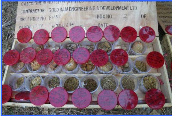
泥土樣本 Soil samples

在進行土地勘測工作時，工程人員會記錄取得樣本的各樣特徵，亦會鑑別樣本的級別。根據土木工程拓展署出版的岩土指南第三冊，岩土是依照特徵、風化程度和堅硬度分為六個級別。第一至第三級代表岩土仍保存原來岩石的結構及硬度，未經風化而分裂或崩解。第四至第六級就是通稱為泥土的岩土層。所謂泥土，其實是岩石因長年累月的自然風化而分解及分裂後形成的散塊甚至碎屑。正因為泥土是岩石外層分解而成，土地勘測時岩石層通常在泥土層之下發現。