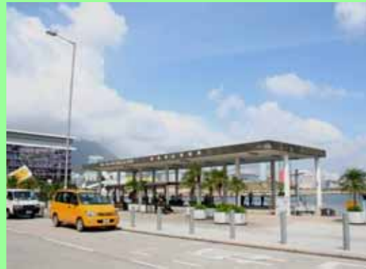
馬頭角公眾碼頭 Ma Tau Kok Public Pier