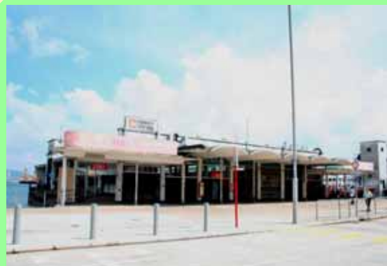
九龍城渡輪碼頭 Kowloon City Ferry Pier