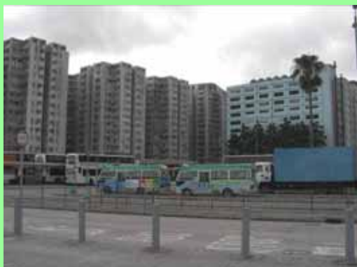
小巴士站 GMB Stop

At the East End of CKR, there will be a section of cut and cover tunnel in the area of San Ma Tau Street. Therefore, the existing public transport interchange at San Ma Tau Street and the public and ferry piers in the vicinity will be affected during the construction stage. To maintain the public services and minimize the impacts to the residents, we are investigating the associated temporary reprovisioning arrangement.