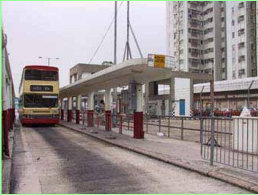
巴士總站 Bus Terminus